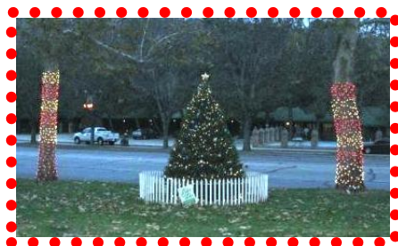
2010 Christmas in Kernville with Hoffman Hospice's "Light Up A Life" Tree