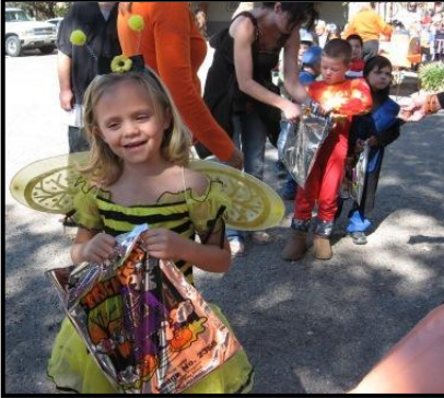
Student from Kernville School going through the line to receive treats.

Our fall Festival of Treats for the Kernville school students went fast and furious this year. Dressed in their "Halloween Best", all the kids lined up at the school and began their Trick or Treating trek by stopping at our chamber building first. Here they picked up a bag from the Elks Lodge, and treats from Kernville Chamber and the First Baptist Church. Then it was onward down the boulevard and all around Circle Park to fill their bags at each business that displayed orange and black balloons. It only took about 5 minutes for the kids to get through our area but they were probably tuckered by the time they went all the way through town and back to school again. Many thanks to all the merchants who participated in the festival.